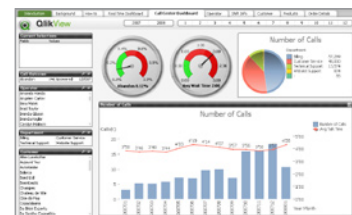
Visually rich, interactive dashboards

“With QlikView, I can analyze data in a way I could only dream about before.”